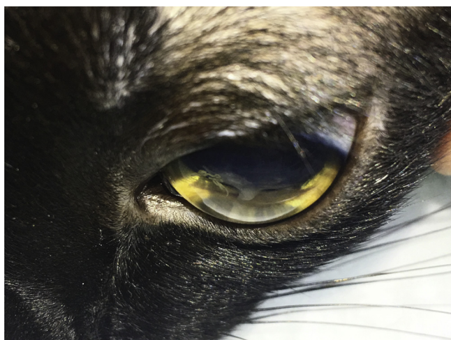
Fig. 1. High angle view of Gurltia parvalysans adhered with fibrin to the anterior chamber of the lens.

sodium hyaluronate 2 mg/ml (Hylo gel® Brill Pharma) thrice/day, and orally with 25 mg/kg of clindamycin (Zodon® Ceva laboratories) twice/day and 0.1 mg/kg of meloxicam (Metacam 0.5 mg/ml Boehringer Ingelheim) once/day. Clinical evolution was favorable, but fibrin deposits remained in the anterior chamber.