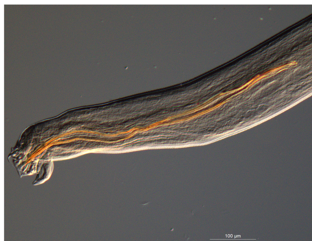
Fig. 2. Caudal end of Gurltia parvalysans showing the bursa and the spicules.

A 1708 bp region of the 18S ribosomal RNA (rRNA) gene was amplified using the primers NC18SF1 (5'-AAAGATTAAGCCATGCA-3') and NC5BR (5'-GCAGGTT CACCTACAGAT-3') as previously described Brianti et al. (2012). Approximately 50 ng of genomic DNA were added to each PCR. The 18S rRNA fragment was amplified using the following conditions: 95 °C for 10 min (first polymerase activation and denaturation); followed by 30 cycles of 94 °C for 30 s (denaturation), 57 °C